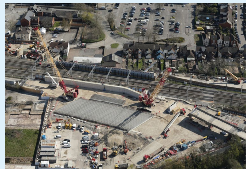
Over 100 beams wait to be installed on Bletchley Flyover