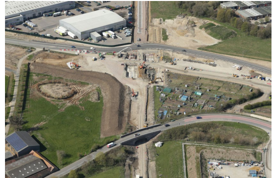
Charbridge Lane overbridge, April 2021

At Bletchley we have continued to carry out the complex work required to bring the Bletchley Flyover up to modern standards. The existing structure above the West Coast Mainline has been successfully dismantled and the bridge abutments that will support the new bridge beams across the railway have been constructed. The new bridge beams will be placed over the West Coast Mainline during a major railway possession that will take place over the early May Bank Holiday.