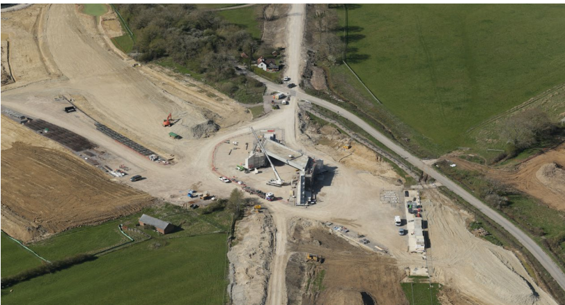
Station Road Overbridge, April 2021

The beams were successfully installed on site in March and the structure is now largely completed. The team will now focus on the significant amount of earthworks that are required to tie the bridge into the local road network.