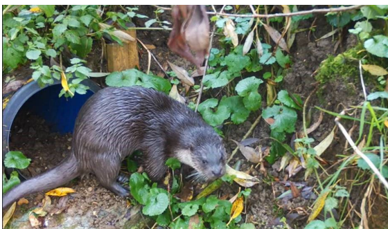
An otter uses one of the artificial holts constructed by the Alliance

You can view the camera footage of an otter entering and exiting the holt in the online version of our EWR2 Project Newsletter.